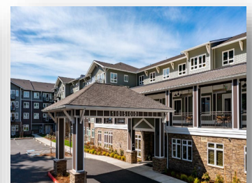
Affinity at Vancouver