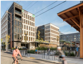
LL Hawkins & Slabtown Marketplace