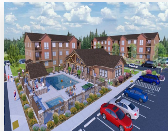
179th St East Apartments Phase I & II