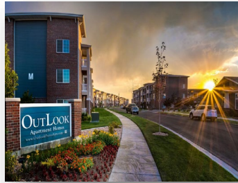
Aldara & Outlook