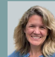
GLOBAL DESIGN HUB