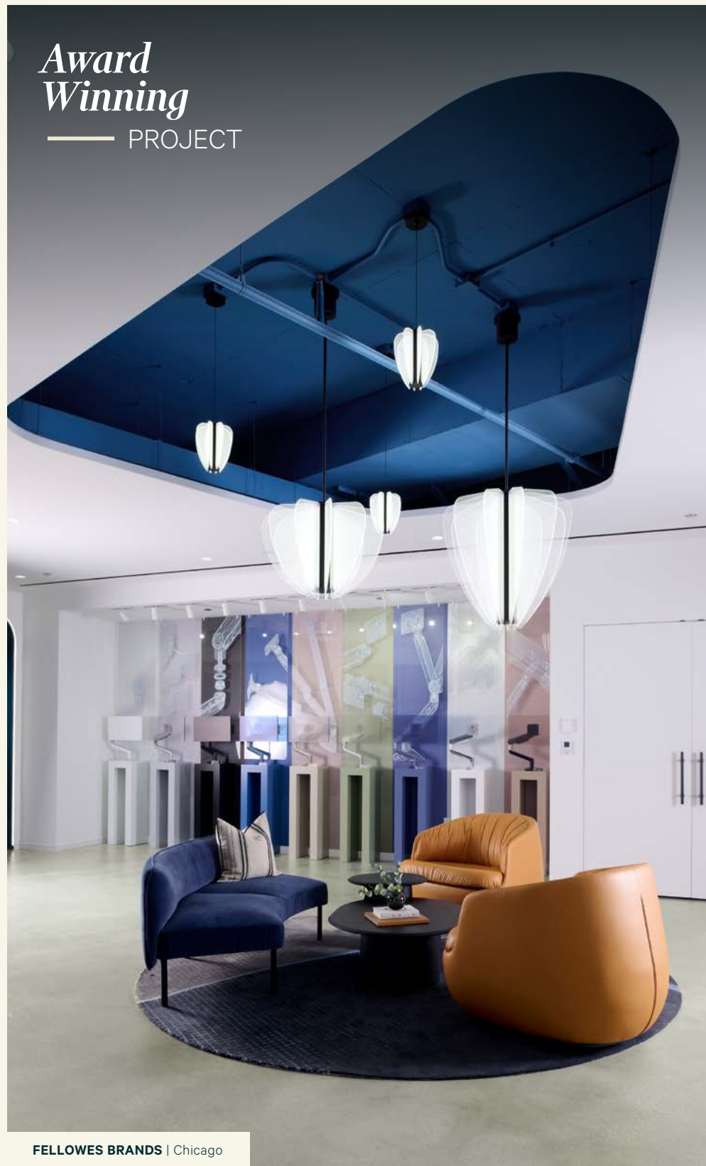
FELLOWES BRANDS | Chicago