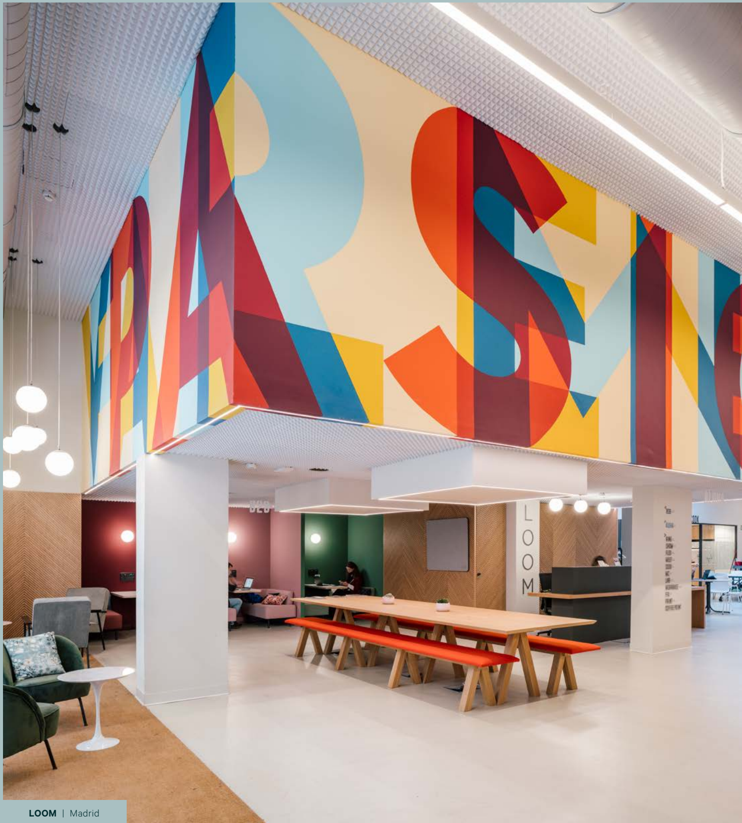
LOOM | Madrid