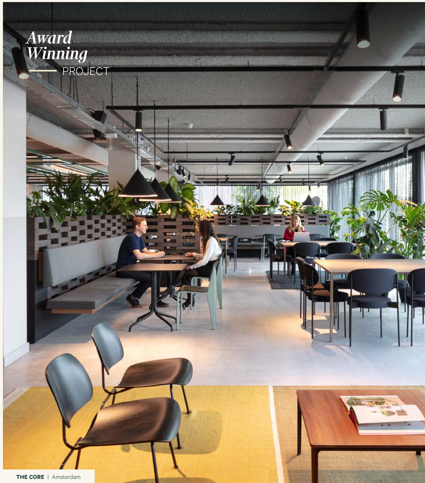
THE CORE | Amsterdam